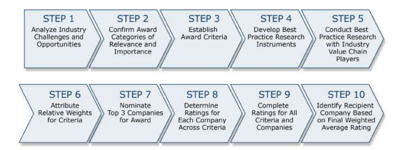
Chart 2: Frost & Sullivan's 10-Step Process for Identifying Award Recipients

This exercise encompasses all criteria, leading to a weighted average ranking of each company. Researchers can then easily identify the company with the highest ranking. As a final step, the research team confirms the veracity of the model by ensuring that small changes to the ratings for a specific criterion do not lead to a significant change in the overall relative rankings of the companies.