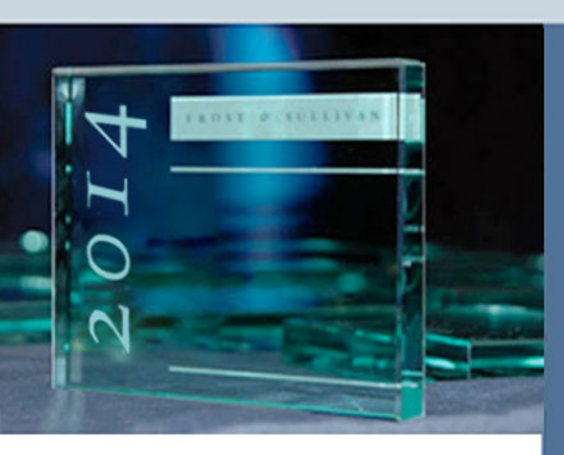
FROST & SULLIVAN

2014 Global Industrial Computed Radiography New Product Innovation Leadership Award