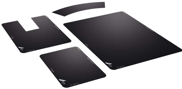
DÜRR NDT Imaging Plates with active side (white/blue) down.

The DÜRR NDT Imaging Plate product range has been carefully designed to fit the specific needs of the non-destructive testing industry with the different types covering the widest range of possible radiographic testing applications.